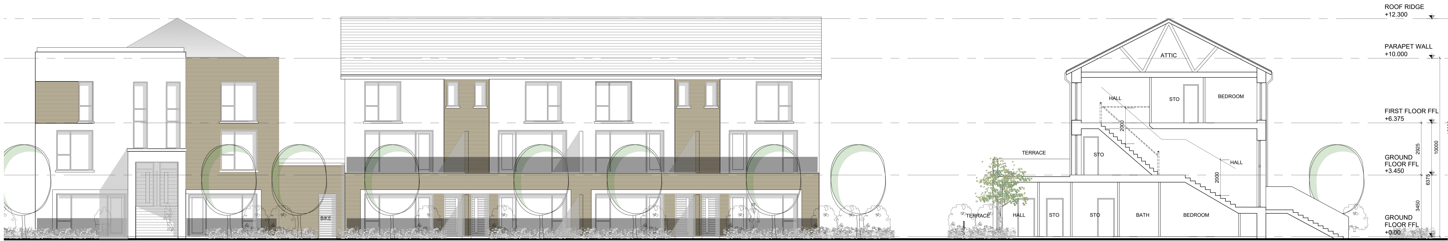
SOUTH EAST ELEVATION C