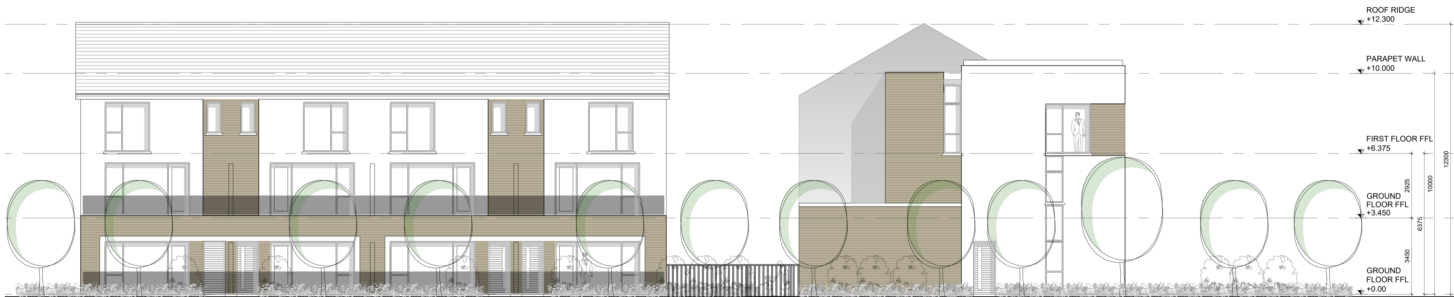
SOUTH WEST ELEVATION D